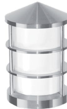
LS582 Balitza Mini

Any luminaire can become hot - take care with appropriate use and placement